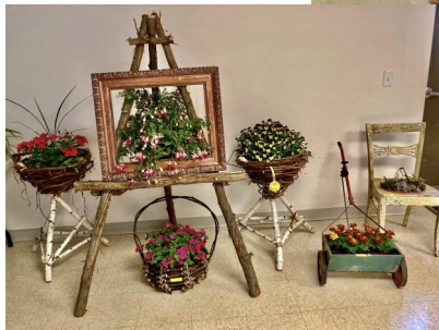
Unique garden art!