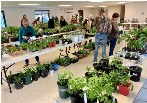
Plants galore (and customers) too! All plants placed, labeled, and priced for Friday's sale. Thank you to everyone who donated plants and a variety of garden-related items.

See more photos on Facebook and our website.