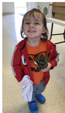
A future customer!